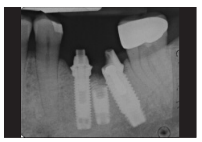
Figure 8: Periapical radiograph of tissue-integrated prosthesis taken at time of delivery.

For the past 6.5 years, the patient has been monitored at recall visits and has been doing well with the prosthesis. Radiographic evaluation has indicated a stable periodontal condition with little or no bone loss associated with the osseointegrated implants ( Fig. 9 ).