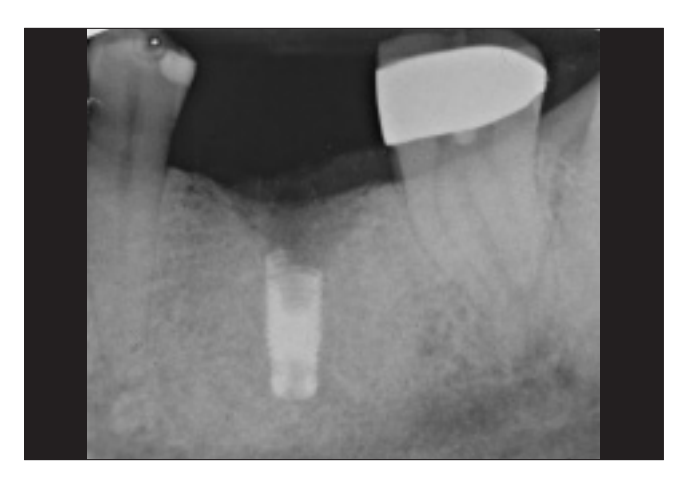
Figure 6: Fractured abutment screw in implant at site 36 with hexagonal portion of implant damaged.

implants (3.75 mm) can successfully be placed in sites with as little as 10 mm of interproximal space to support a molar restoration.<sup>6</sup>