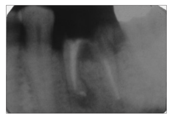
Figure 2: Preoperative periapical radiograph of tooth 36.

The patient was interested in the implant option; however, for financial reasons, he sought a second opinion regarding a "cheaper solution." Within a year of his initial visit, another treating dentist had extracted tooth 36 and had restored it with a single standard-diameter implant supporting a screw-retained ceramo-metal crown ( Fig. 3 ).