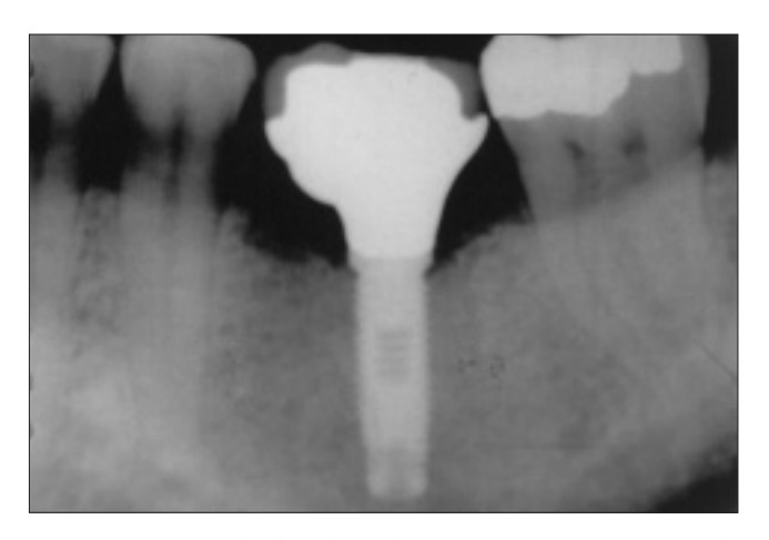
Figure 3: Radiograph of single-implant ceramic crown retained with a metal screw.

screw had fractured. The patient was advised of the risk of complications that might arise from such a prosthetic design, including damage to the implant and fracture of the solder joint. Approximately 2 months later, the patient returned with the complaint of a fractured restoration. Further evaluation revealed that the solder joint between tooth 37 and the implant at tooth 36 had fractured ( Fig. 5a ).