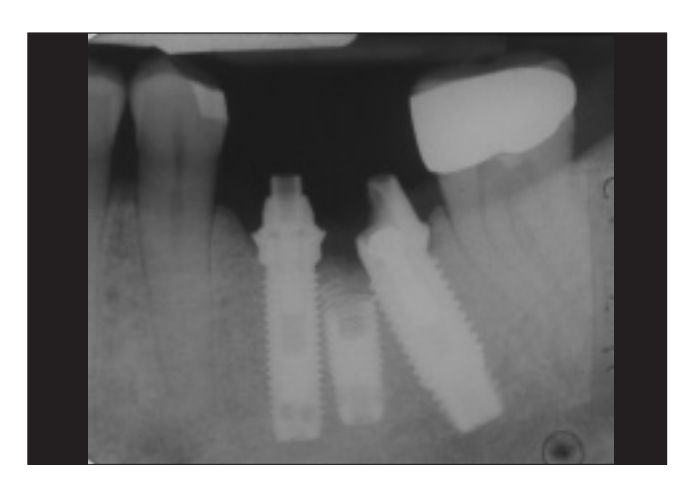
Figure 7: A periapical radiograph was taken at time of delivery to verify the abutments.