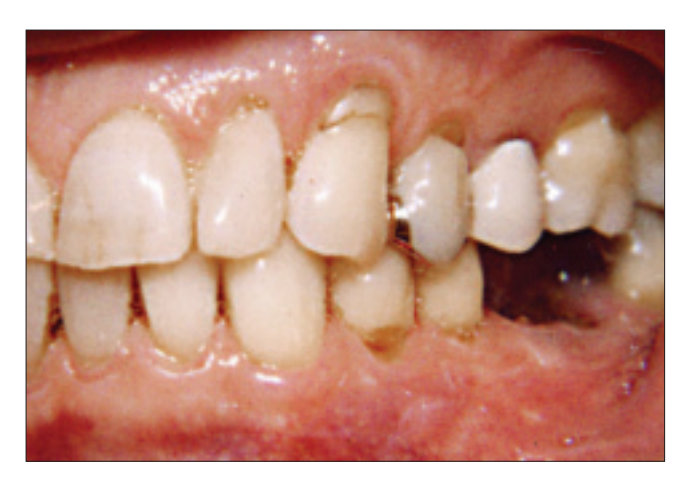
Figure 1b: Preoperative left view of tooth 36.

Fifteen months after the patient's first return visit, he presented to the clinic wearing a 2-unit ceramo-metal fixed partial denture supported by tooth 37 and an implant in the area of tooth 36 ( Fig. 4 ). The retainer of the fixed partial denture was not seated on the implant replacing tooth 36, but was cantilevered off tooth 37. The abutment