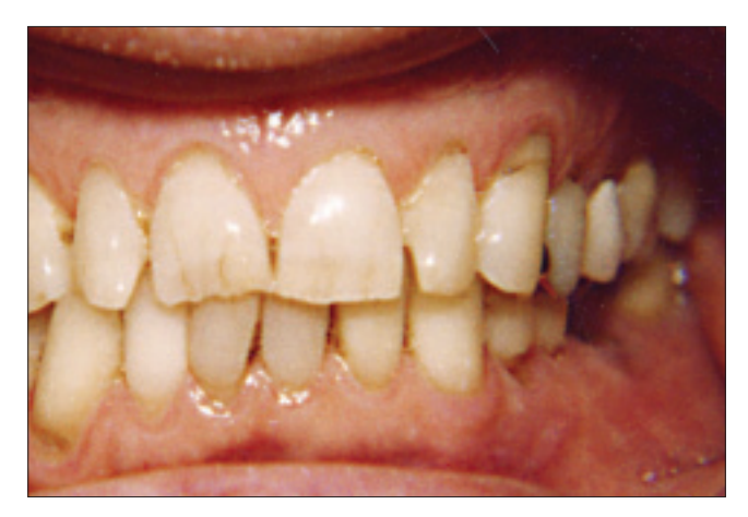
Figure 1a: Preoperative frontal view showing missing crown on tooth 36.